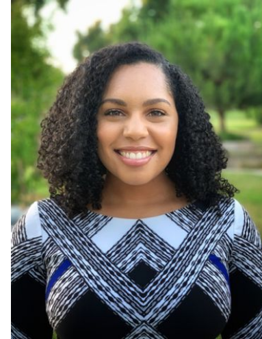
Sky Allen Inland Empire United